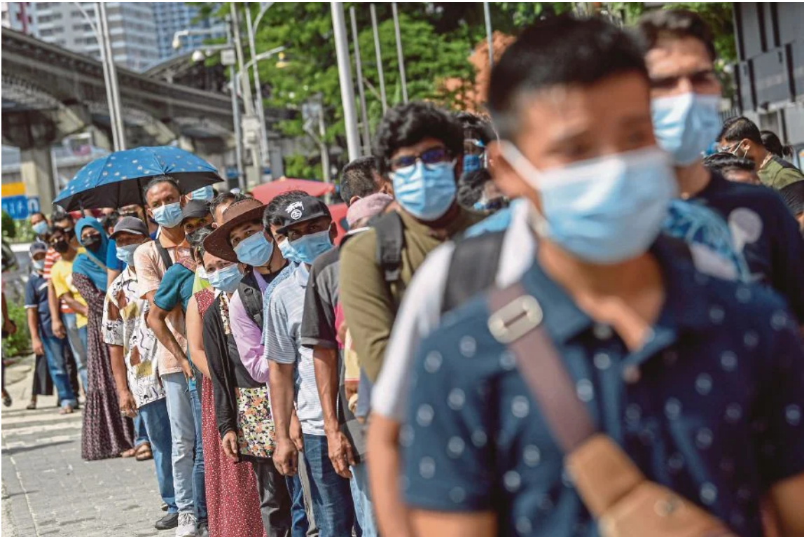
Foreign workers lining up outside the Rumah Prihatin Grand Seasons Hotel vaccination centre in Kuala Lumpur yesterday.

By Dawn Chan , Teh Athira Yusof - August 12, 2021 @ 9:01am